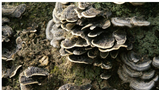
Bracket fungus on an old tree stem