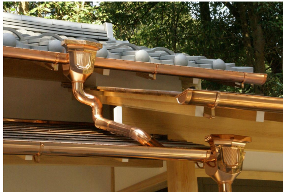
Brand new copper pipes on a newly built house on the temple grounds

The carpenters took off their shoes before stepping inside the 'building'