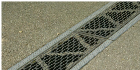
Decorated drainage cover