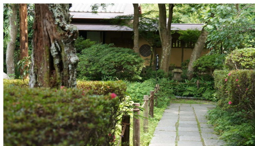
Path in the front garden

At the end of the garden, I walked up a slope on the left hand side which leads to a cemetery and smaller side entrance to the temple. The slope has some nice view points on the mountains around, but it is not the main way to the temple. I entered the garden via a grove of old plum and cherry trees - covered in moss, with low branches, so you have to duck under them.